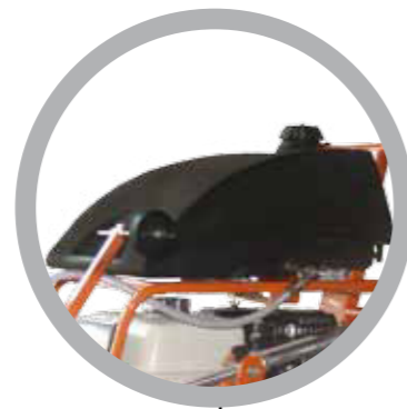
water tank 30 liter