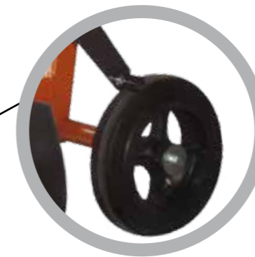
big wheels for easy moving on construction site