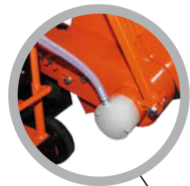
water cooling through the blade shaft