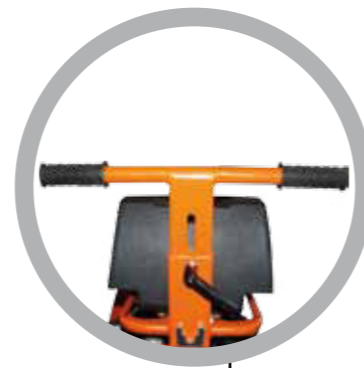
handle bars adjustable for ergonomic working position